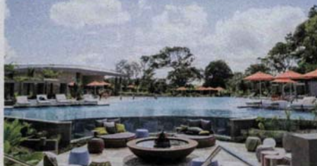
Below: Relax by the pool at Elements Of Byron. Right: Dine at The Balcony. Above right: Go up, up and away on a hot air balloon ride

dunes, the 203 studios and one and two-bedroom villas are dotted around the resort. Adventurers will adore the chirping of exotic birds and the guided nature tours around the site, while chic urbanites will enjoy chilling by the infinity pool, with its circular day beds suspended above water, having sundowners by the fire pit and dining at Graze, with its modern artwork and funky copper light fixtures.