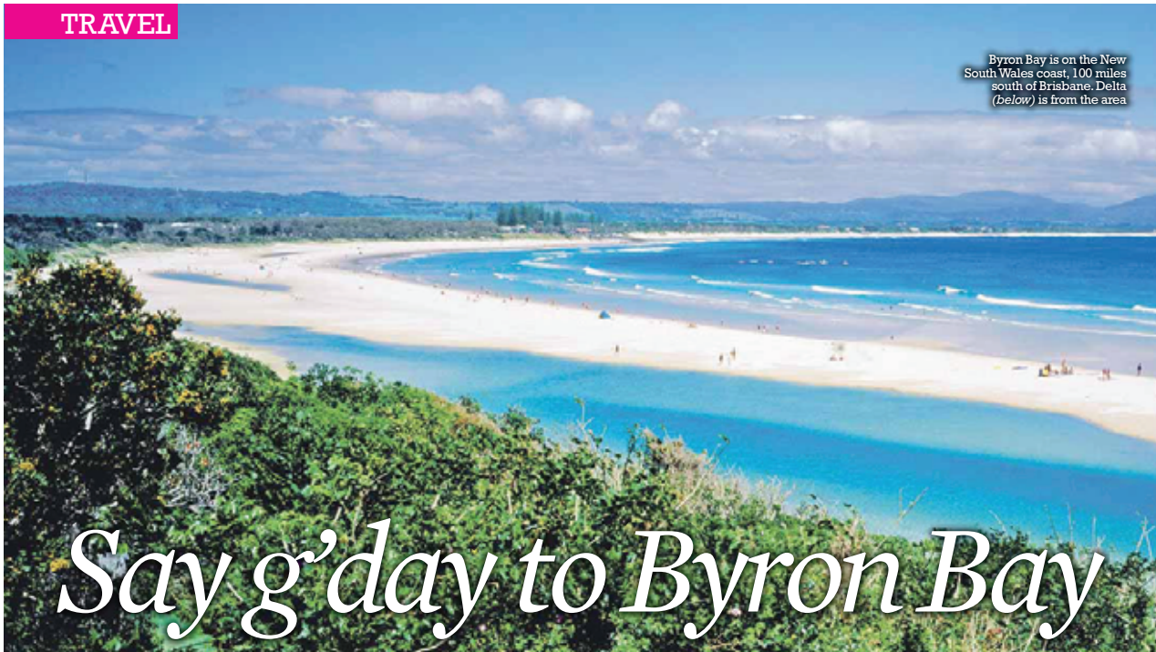
Byron Bay is on the New South Wales coast, 100 miles south of Brisbane. Delta (below) is from the area